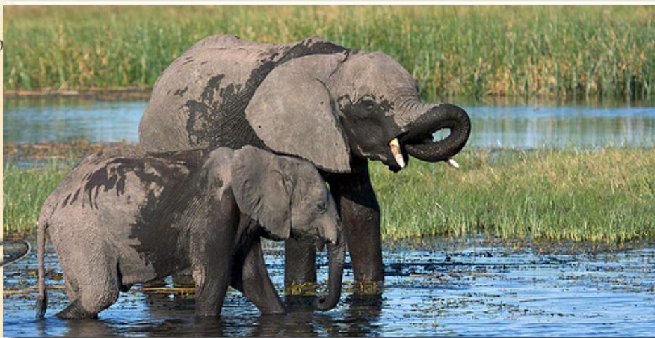
Chobe National Park