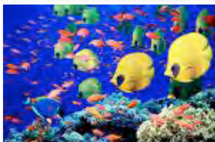
Wadi Gemel National Park, Red Sea