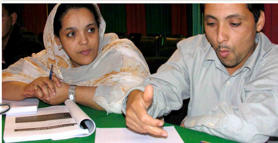
Park Management Planning Workshop

ECOTOURISM PLANNING and MARKETING NATIONAL WORKSHOP SERIES for USAID Madagascar and the Association for the Management of Protected Areas.