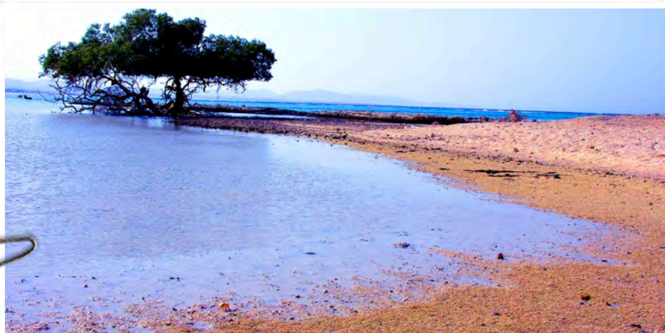
Wadi Gemel National Park