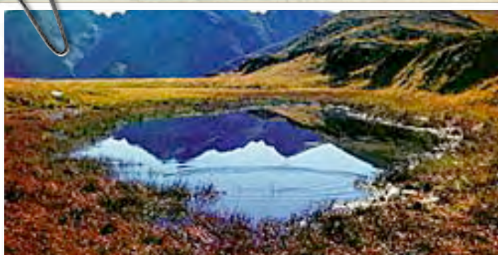
Retezat National Park

Retezat National Park was eager to join the exclusive PAN Park Network but required a Sustainable Tourism Strategy for both the park and the surrounding region.