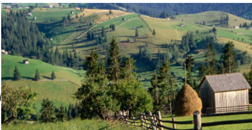
Heritage Landscape Protection