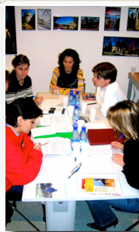
Product Planning Workshop