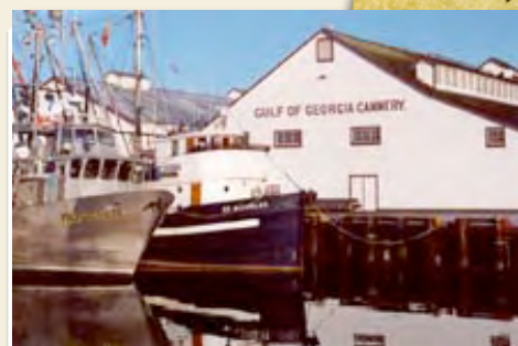
Gulf of Georgia Cannery National

The park master plan identified 22 buildings of heritage value. James was responsible for both the development plan, construction and placement of all buildings on the village site.