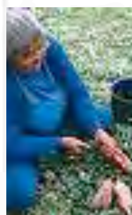
Protecting Cree heritage