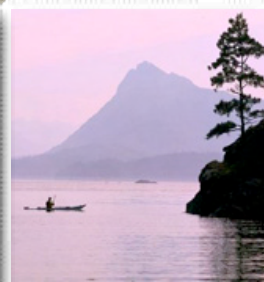
Pacific Rim National Park

"protected area management integrates biodiversity protection, visitor education and economic development"