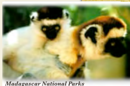
Madagascar National Parks