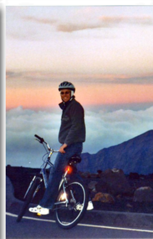
Gatineau Park Cyclist

The Sunderbans is the largest delta and mangrove forest in the world and comprises a 2500 sq. km. wildlife reserve. James was one of three specialists preparing an economic development strategy for the Sunderbans region in Southern Bangladesh to increase local jobs and revenues to support the conservation of the forest resources and the protection for the Royal Bengal Tiger.